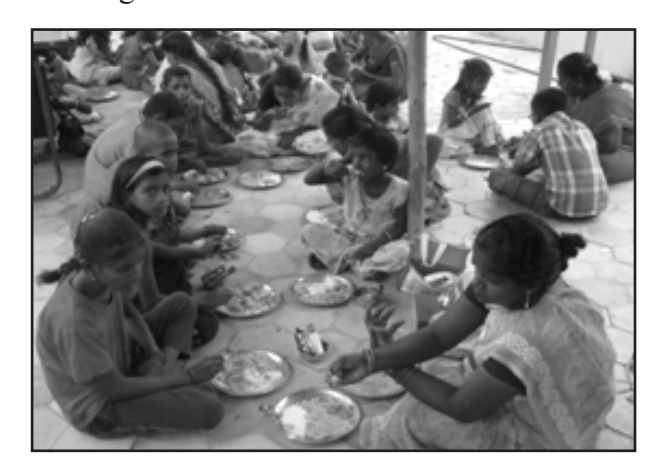
Annadaanam in progress for mothers and children