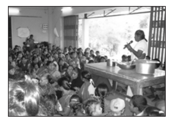
Soup preparation with locally available ingredients by DMS nurse