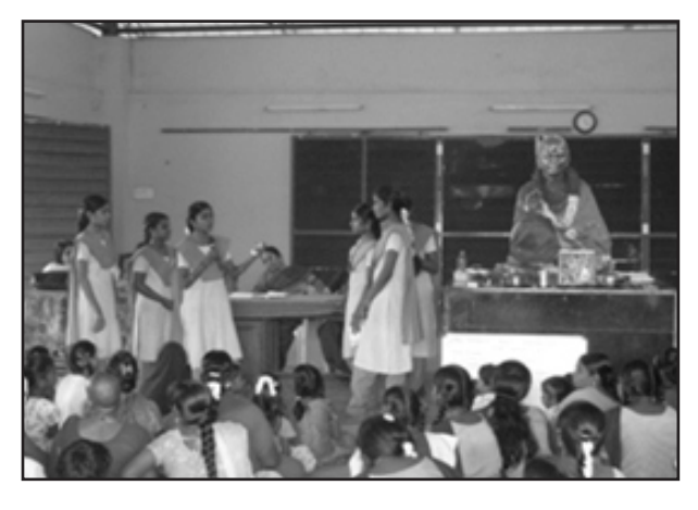
Students enacted skits to bring out significance of Breast Feeding