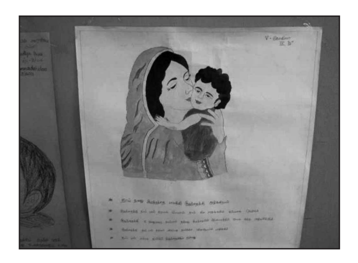
Poster by V. Kokila, Padiyanallur