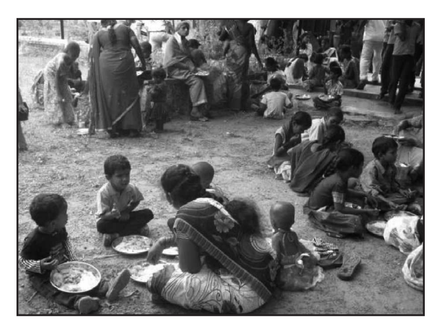
Annadanam in progress for mothers and children