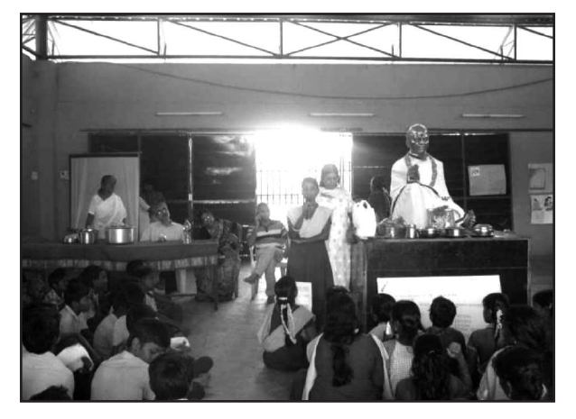
Oratorical contest on importance of Breast Feeding