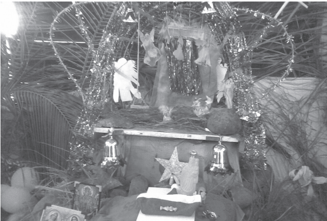
Crib for Jesus