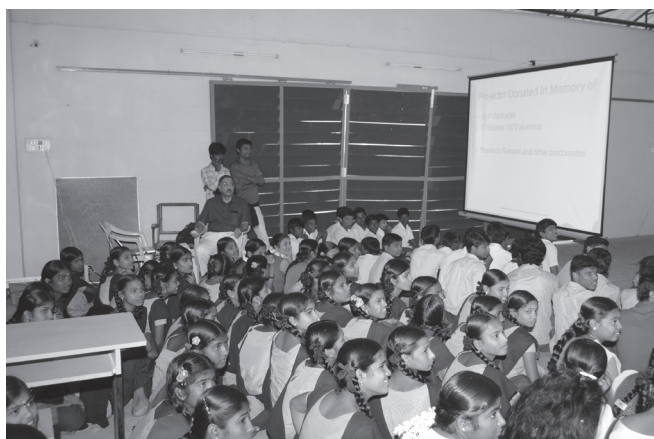
LCD Projector Inauguration