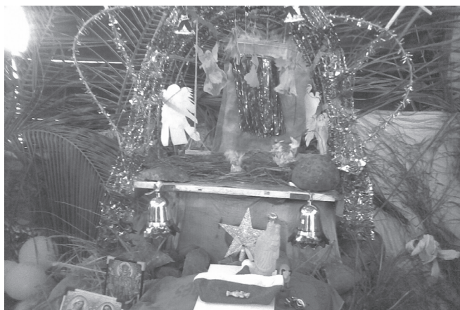
Crib for Jesus