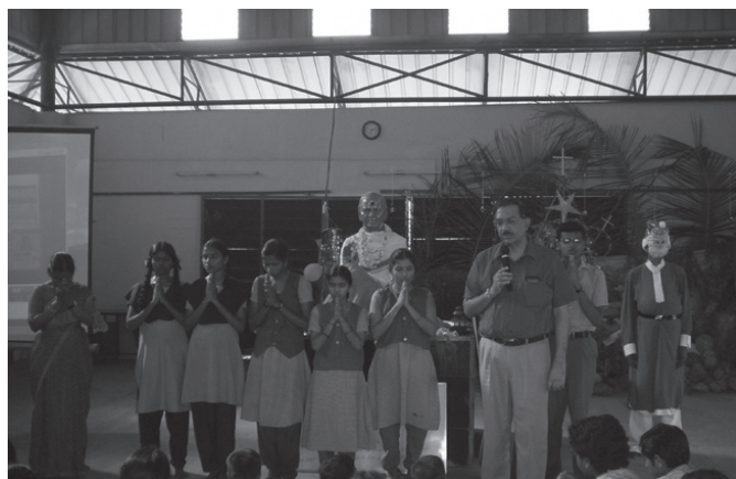
Prayers done by the Students