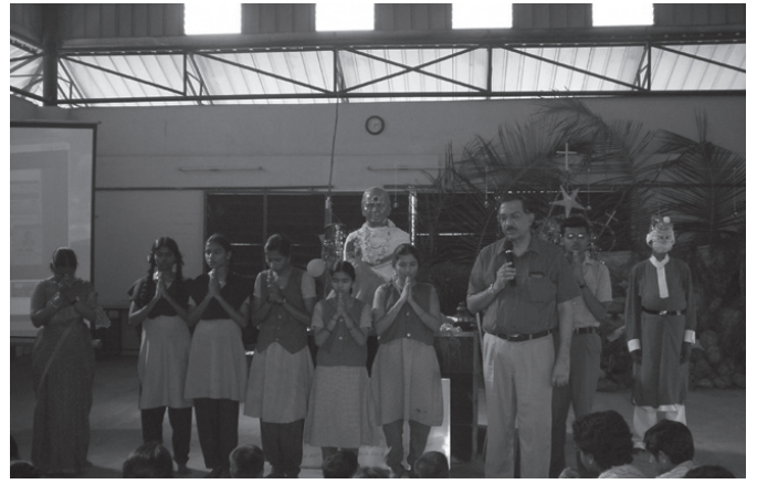
Prayers done by the Students