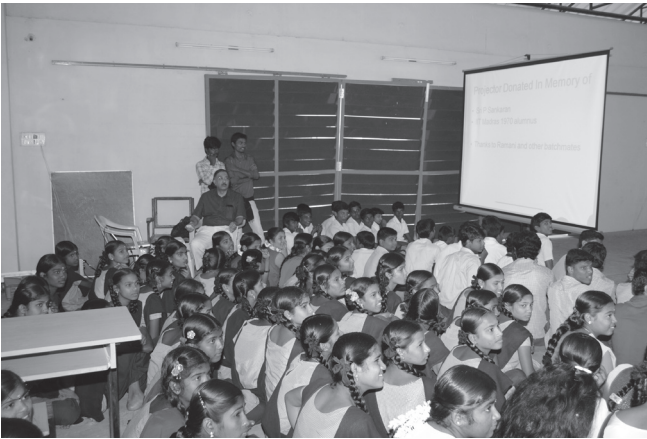
LCD Projector Inauguration