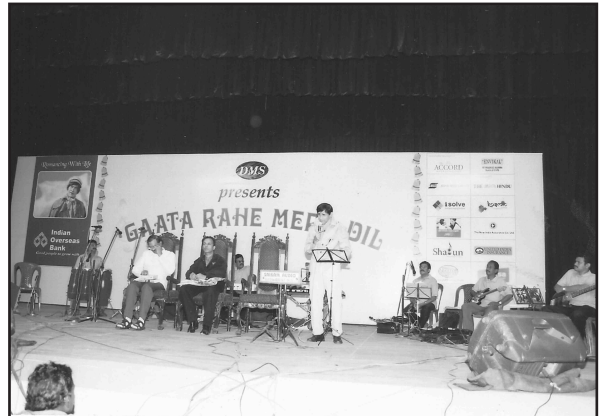
Dev Anand and son Sunil Anand at DMS Gaata Rahe Mera Dil Show on 16th February 2008.